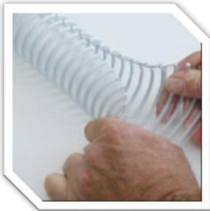
SPLIT GUARD SHOWN ABOVE